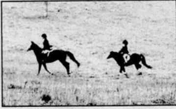
The Sautter/daughter team pairs up for a run.