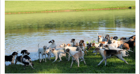
Hunting of a Different Kind To kick off this new column "Clay's Half-Assed Bear Hunt"

The hounds are enjoying the dog days of summer and their new digs. Are you doing something fun or interesting outside of foxhunting this summer? Pleas share your adventures with us this off season!