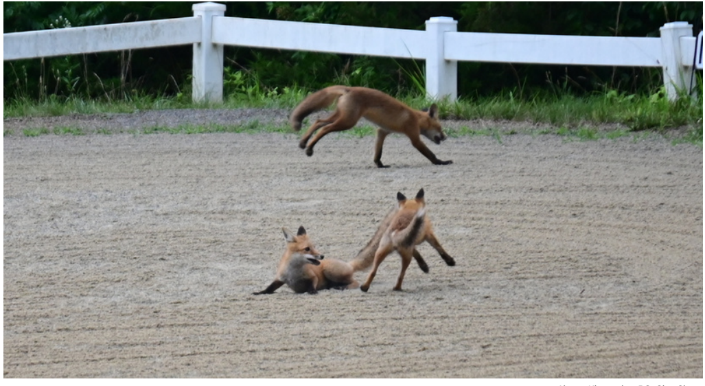
Above: Kits at play. PC: Clay Chase