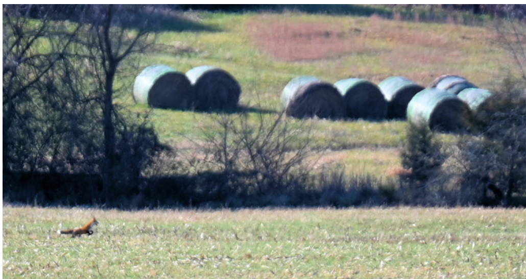
Above Fox viewed during November's Junior Meet from Highland's.