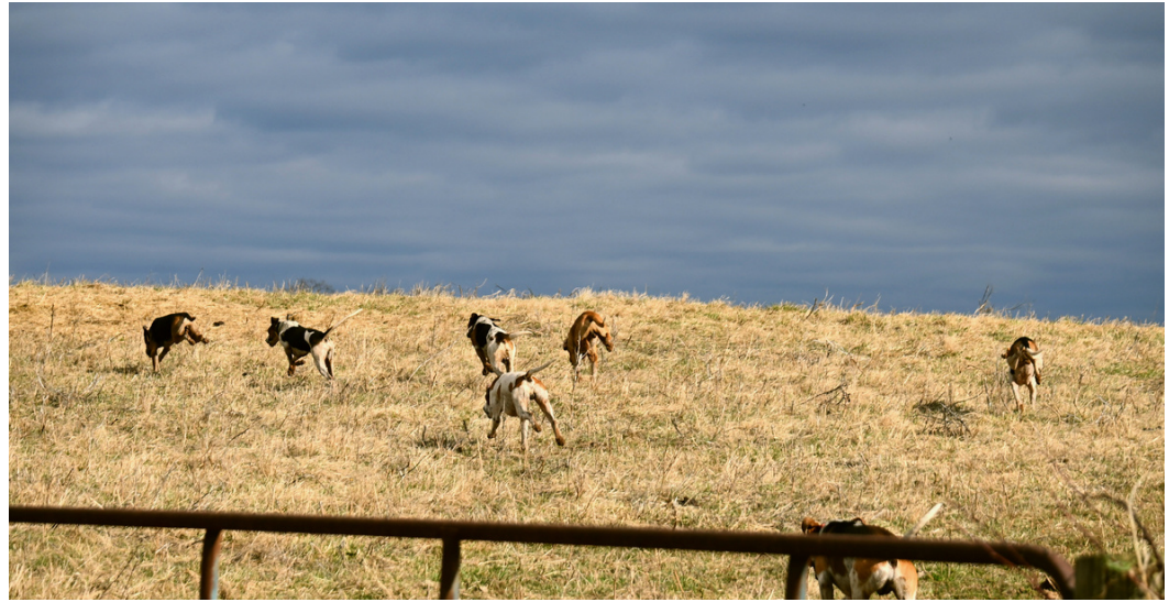
Above: Joint Meet with Middleburg Hounds, January 14th, 2023