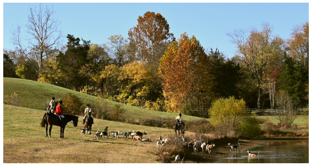
Above: Staff giving the hounds a quick dip before hunting during an unseasonably warm Opening Meet..